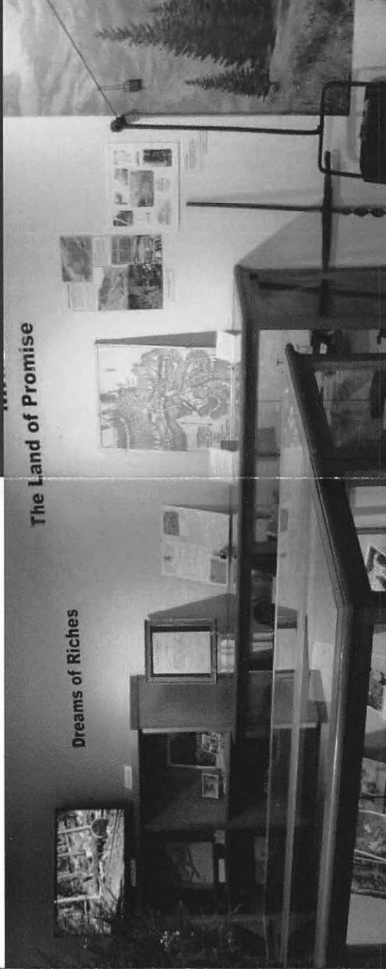
Dreams of Riches

On October 24, 2003, after over two decades of preservation efforts, the Mineral King Road Cultural Landscape District was listed on the National Register of Historic Places. One year later, national legislation was passed allowing the Mineral King cabins to be retained by their permitted owners, heirs and assignees. With the future of the community stabilized, the management of the historic district has now become a cooperative effort of the Sequoia National Park administration, the Mineral King Preservation Society, and the Mineral King District Association.